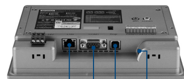
Ethernet COM1 (RS-232/422/485) | USB Client | Micro SD Slot